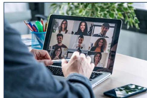
Virtual Workshop / Coaching Facilitated by Certified Success-Minded Leader Coach