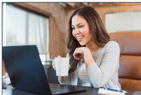
Self-Paced Online Assignments and Practice

A key Success-Minded Leader difference is bite-sized content, practice and ongoing coaching feedback that allows for better retention and accelerated growth of participants.